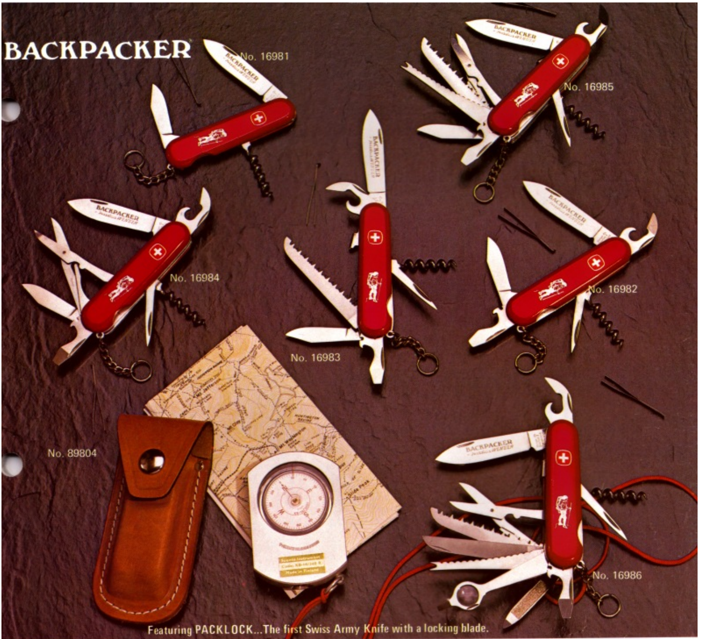
Featuring PACKLOCK...The first Swiss Army Knife with a locking blade.

Introducing the all new BACKPACKER® Series of Original Precise/Wenger Swiss Army Knives. Designed for the American backpacker, they are engineered with a new, easy-to-work locking blade for even greater safety, plus compact versatility and the "most wanted" blades. Another "first again" innovation in Swiss Army Knife design by Precise/Wenger.