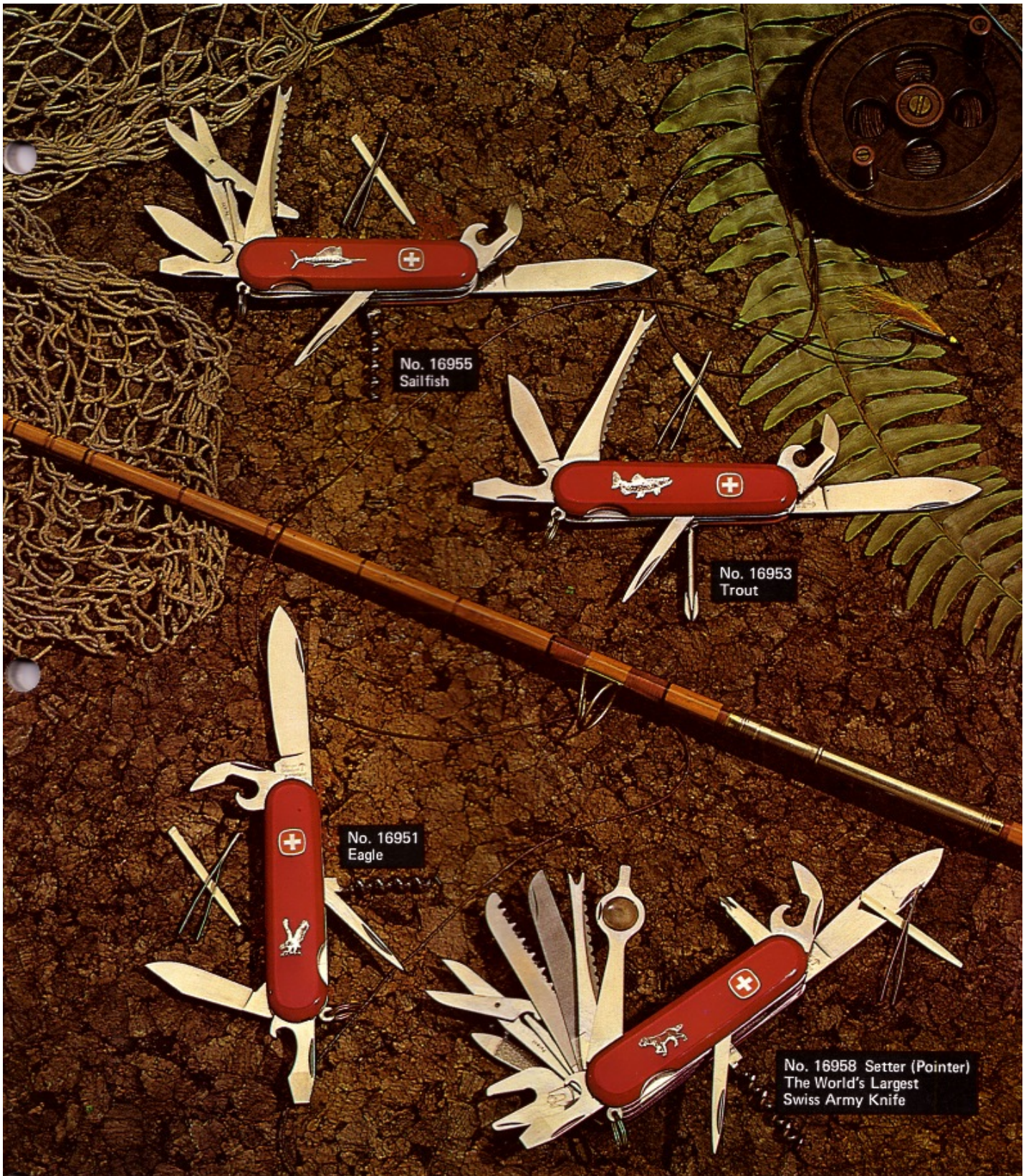
No. 16955 Sailfish